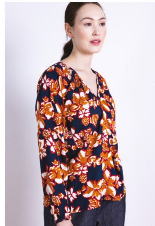
MT4227 / Gathered Neck Top 100% Viscose Twill Oxford / Sizes 8-20