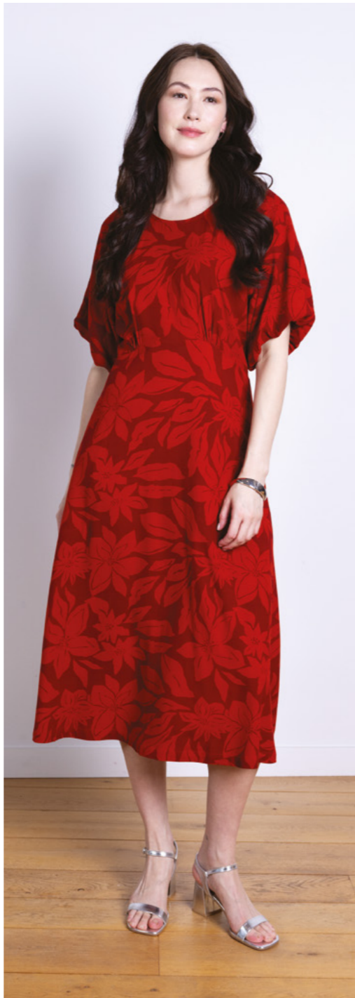
AM2206 / Puff Sleeve Dress 100% Viscose Burgundy / Sizes 8-20