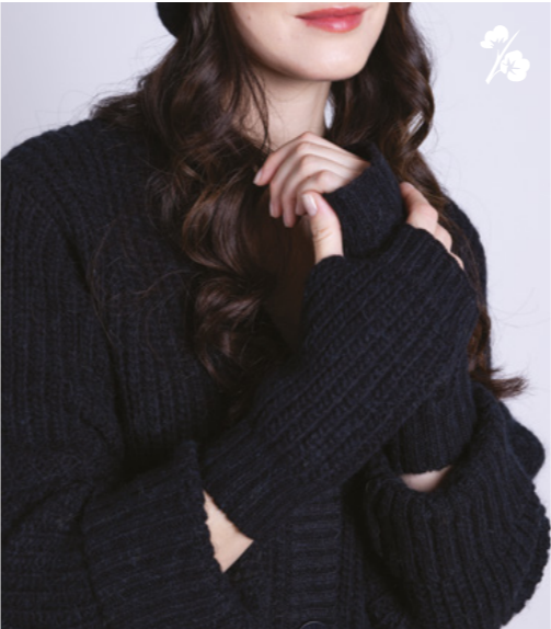
AP0212 / Knitted Hat 83% Organic Cotton, 17% Alpaca Black / One Size