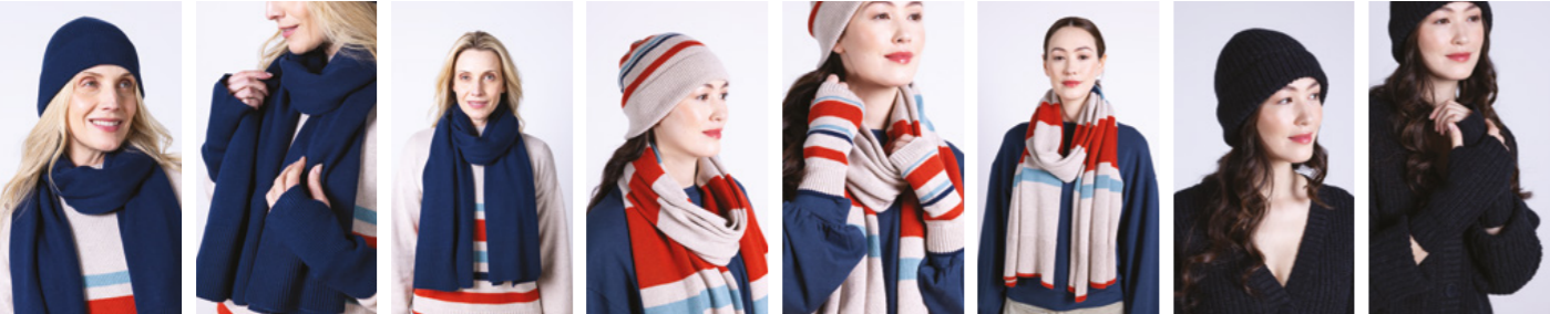
KT0212 / Thunder Pg 15 KT0503 / Thunder Pg 15 KT0327 / Thunder Pg 15 KT0212 / Multi Pg 14 KT0503 / Multi Pg 14 KT0327 / Multi Pg 14 AP0212 / Black Pg 59 AP0503 / Black Pg 59