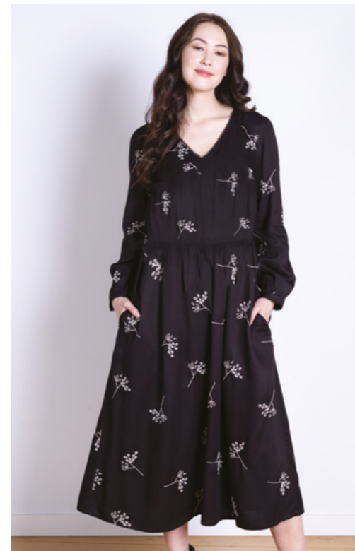
EM2205 / Embroidered Midi Dress 100% Viscose Twill Black / Sizes 8-20