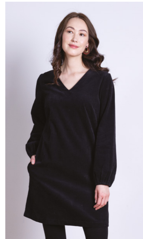
NR3176 / Gathered Cuff Tunic Dress 100% Cotton Chunky Cord Black / Sizes 8-20