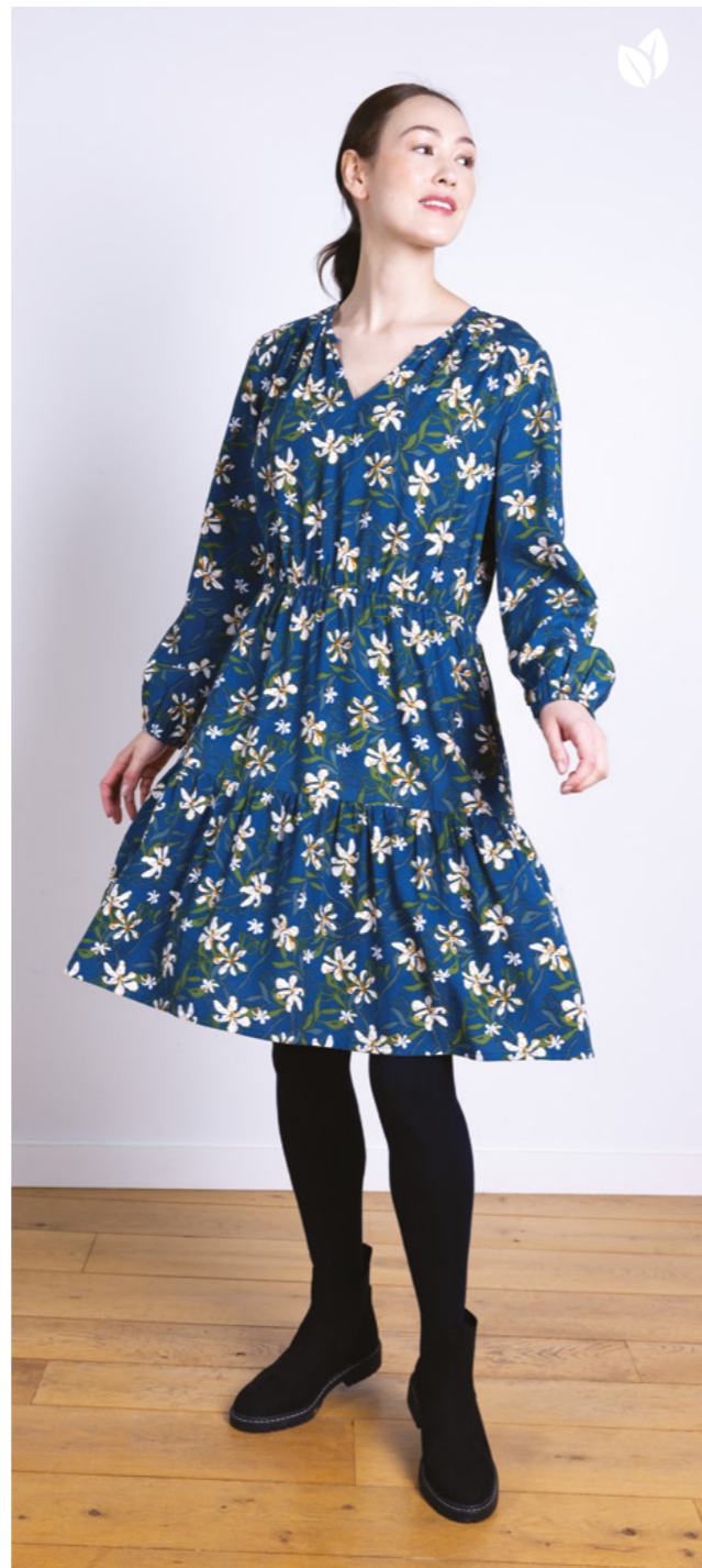
LC3178 / Gathered Tunic Dress 100% Woven Ecovero Viscose Oxford / Sizes 8-20