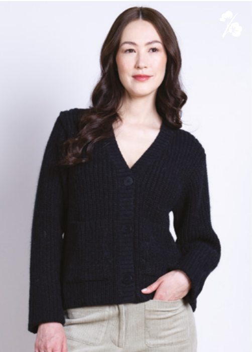
FC7092 / Ribbed Sleeve Jumper 100% Organic Cotton Ivory / Sizes S,M,L