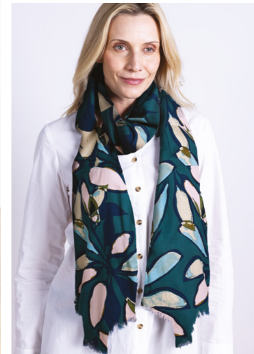
SD2190 / Bubble Midi Dress 100% Textured Tencel Nordic / Sizes 8-20