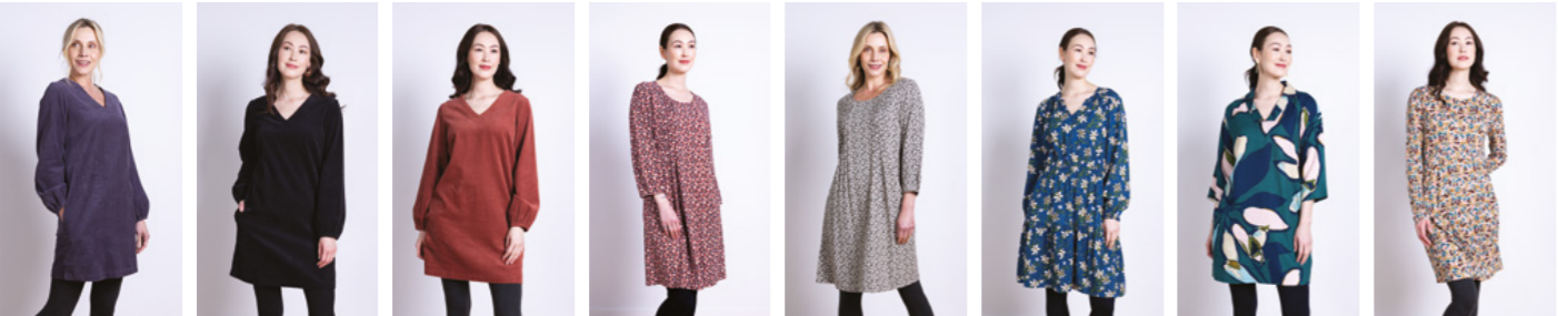
NR3176 / Plum Pg 24 NR3176 / Black Pg 55 NR3176 / Rose Pg 28 IV3179 / Scarlet Pg 12 IV3179 / Buff Pg 33 LC3178 / Oxford Pg 44 SD3169 / Nordic Pg 42 DL3146 / Ecru Pg 29