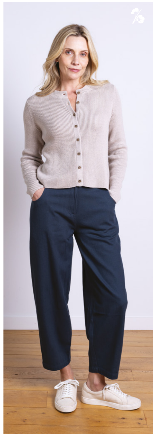
KT7094 / Button Through Cardi 80% Organic Cotton, 20% Wool Sand / Sizes S,M,L