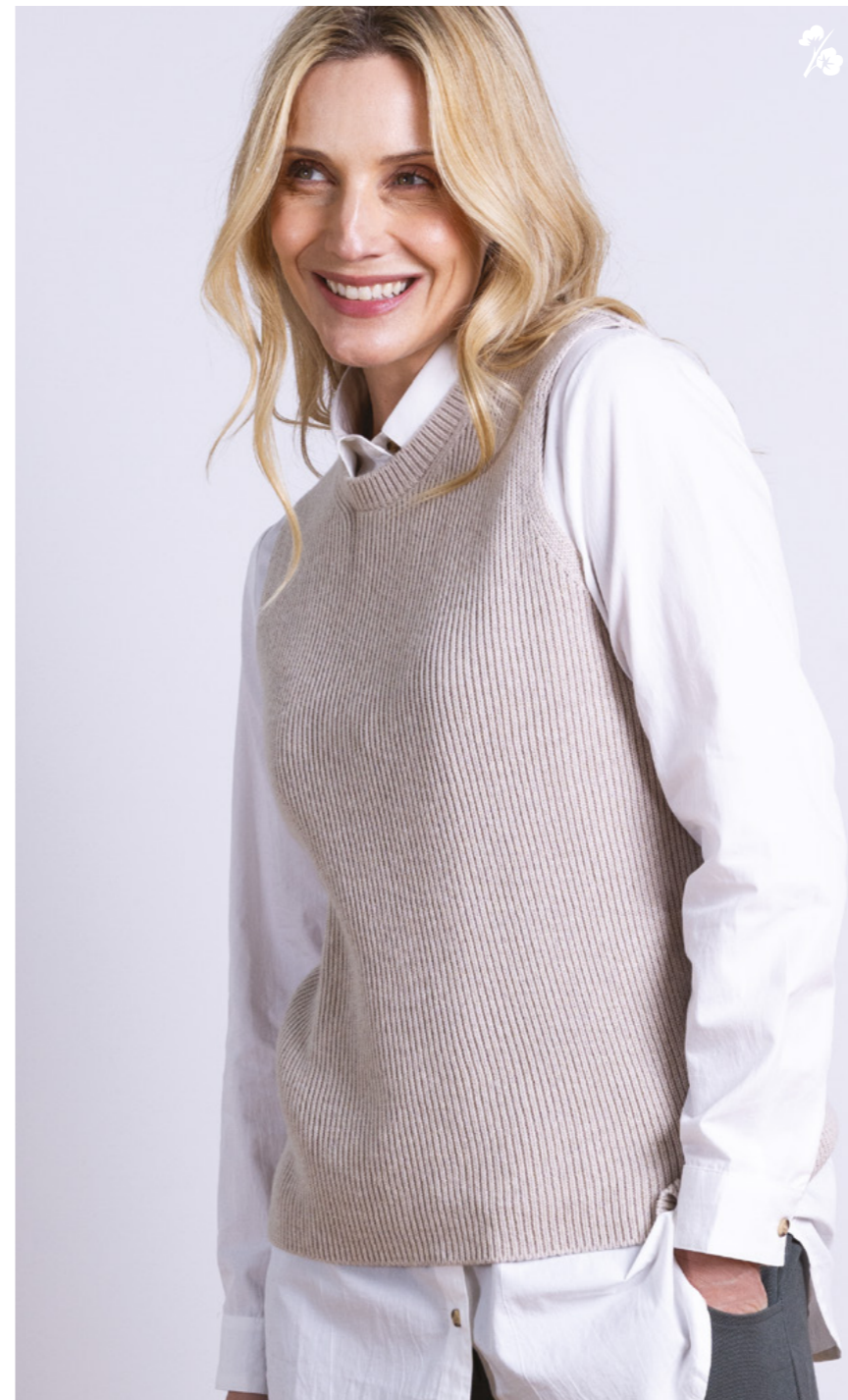
KT7097 / Knitted Vest 80% Organic Cotton, 20% Wool Sand / Sizes S,M,L