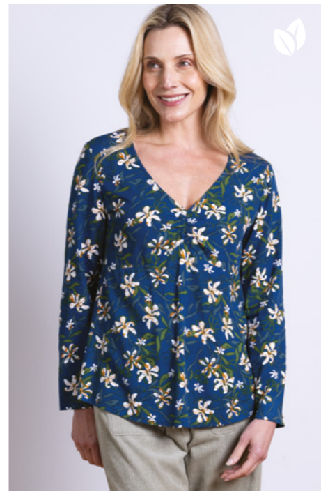
LC4225 / Ruched Front Long Top 100% Woven Ecovero Viscose Oxford / Sizes 8-20