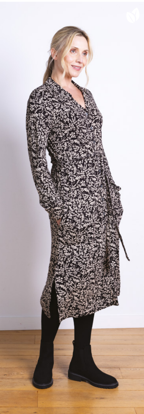
BP2090 / Shirt Dress 100% Lenzing Ecovero Jersey Alabaster / Sizes 8-20