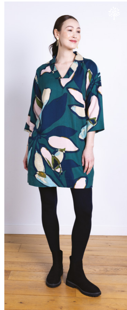
SD3169 / Collared Tunic Dress 100% Textured Tencel Nordic / Sizes 8-20