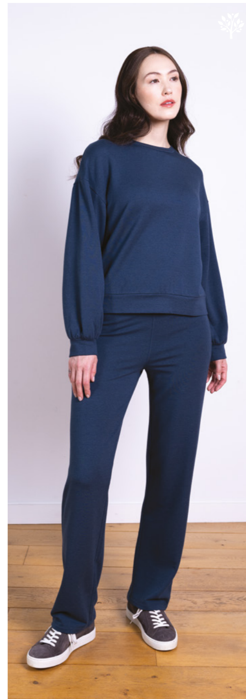
MC4223 / Sweatshirt Top 70% Lenzing Modal, 25% Cotton, 5% Elastane Space / Sizes 8-20