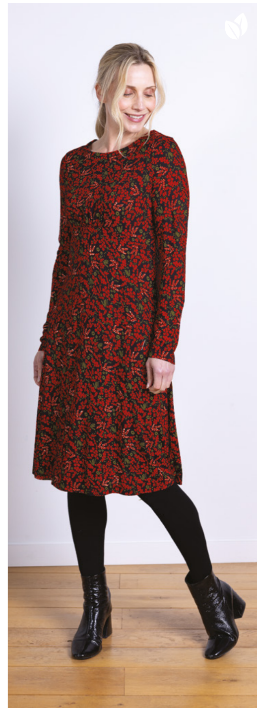
BP3171 / Gathered Front Tunic Dress 100% Lenzing Ecovero Jersey Jam / Sizes 8-20