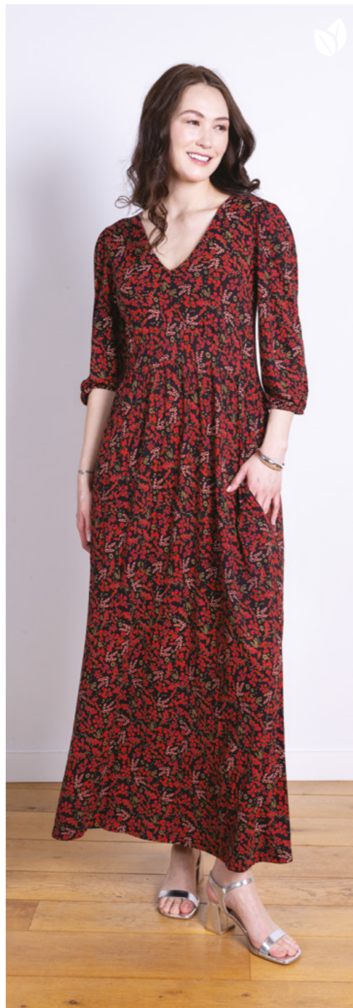
BP2193 / Puff Sleeve Maxi Dress 100% Lenzing Ecovero Jersey Jam / Sizes 8-20