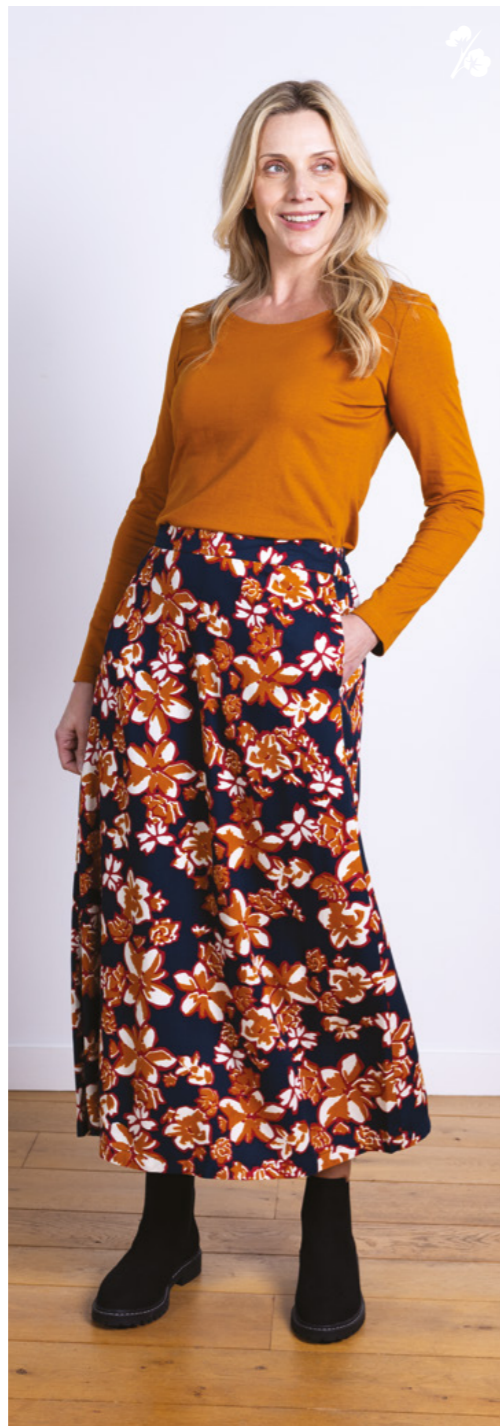
JP4064 / Round Neck Top 100% GOTS Organic Cotton Jersey Apricot / Sizes 8-20