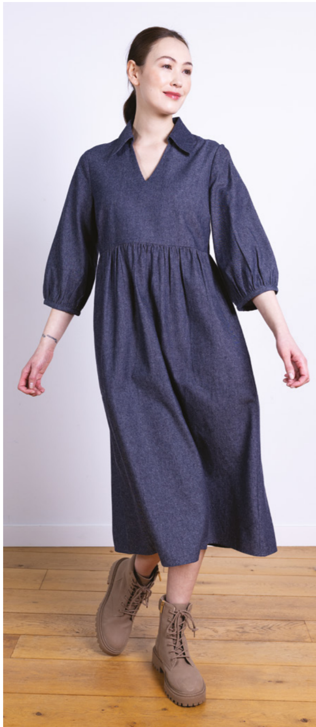
CH2191 / Open Collar Midi Dress 100% Cotton Chambray Chambray / Sizes 8-20