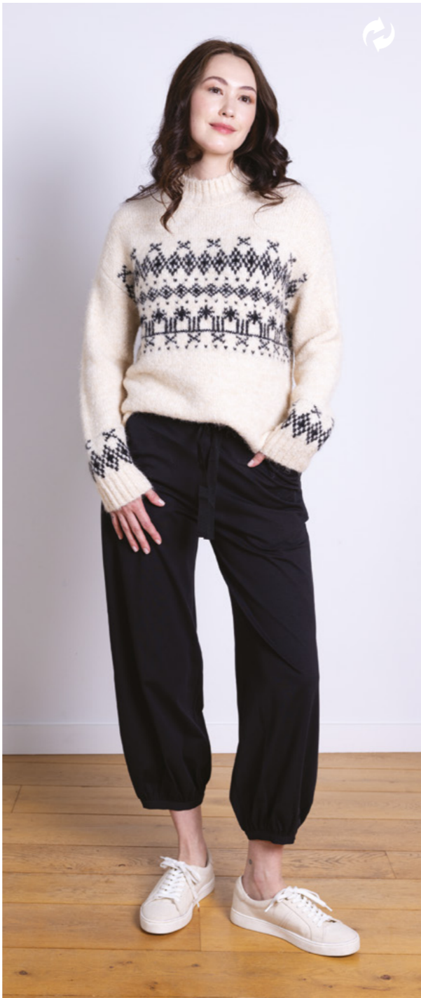
RW7089 / Fairisle Jumper 53% Recycled Polyester, 6% Wool, 30% Polyamide, 10% Polyester, 1% Elastane Ivory / Sizes S,M,L