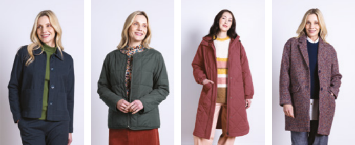
HJ6037 / Midnight Pg 39 QL6036 / Buff Pg 30 QL6522 / Rose Pg 34 QW6524 / Rust Pg 12