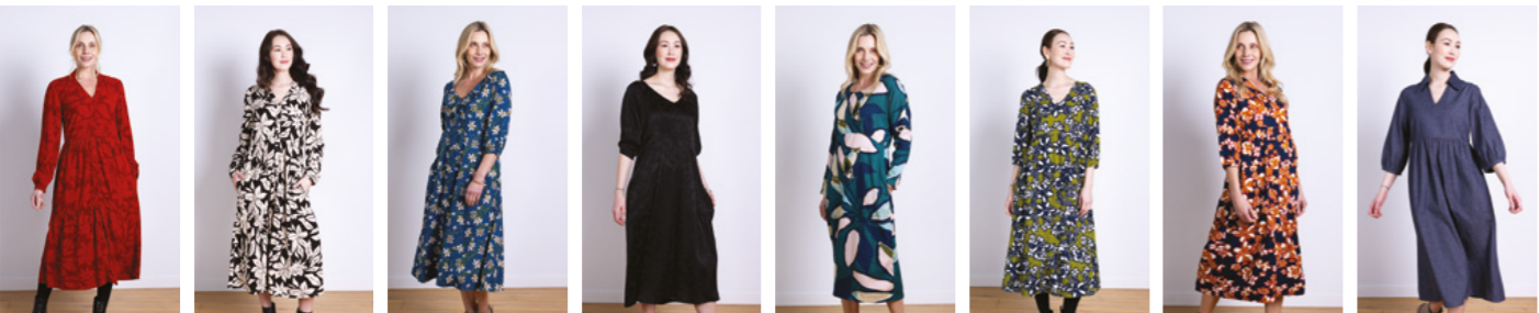
AM2196 / Burgundy Pg 51 AM2196 / Black Pg 53 LC2192 / Oxford Pg 45 VJ2197 / Black Pg 51 SD2190 / Nordic Pg 43 MT2219 / Pea Pg 38 MT2219 / Oxford Pg 10 CH2191 / Chambray Pg 8