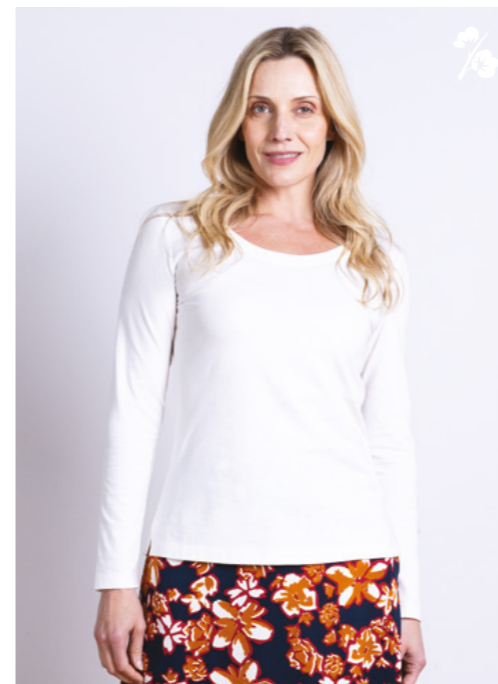
JP4064 / Round Neck Top 100% GOTS Organic Cotton Jersey Ivory / Sizes 8-20