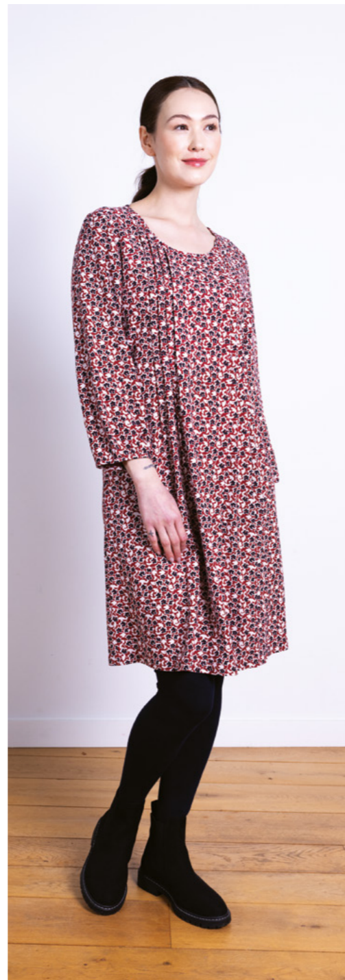
IV3179 / Pintuck Tunic Dress 100% Viscose Scarlet / Sizes 8-20