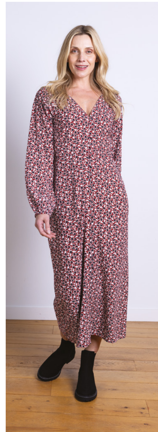
IV2195 / Sweetheart Midi 100% Viscose Scarlet / Sizes 8-20