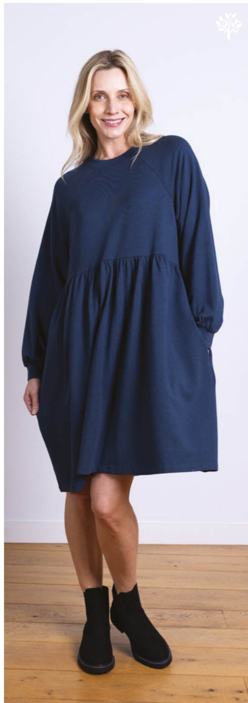
MC3170 / Sweatshirt Tunic Dress 70% Lenzing Modal, 25% Cotton, 5% Elastane Space / Sizes 8-20