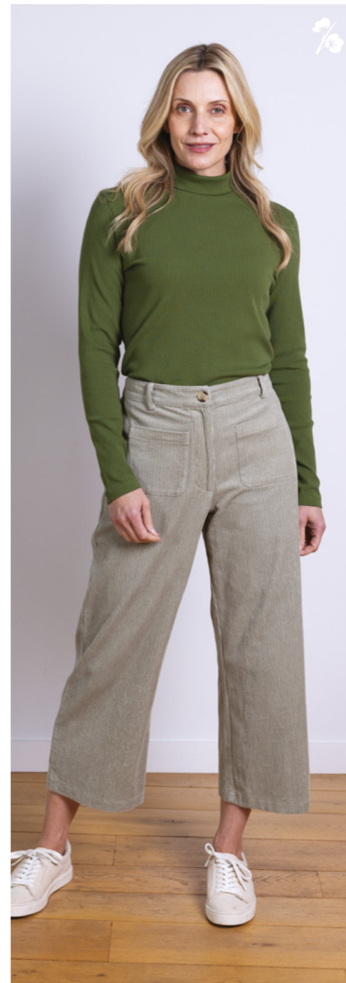
RJ4249 / Rib Polo Neck Top 95% Organic Cotton, 5% Spandex Basil / Sizes 8-20