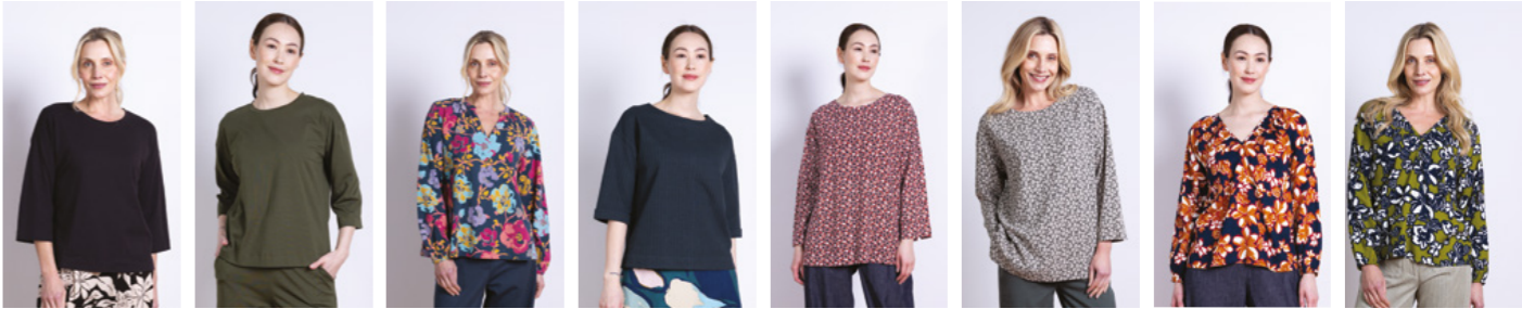
JP4226 / Black Pg 53 JP4226 / Juniper Pg 40 BL4230 / Space Pg 21 HJ4184 / Midnight Pg 42 IV4235 / Scarlet Pg 13 IV4235 / Buff Pg 33 MT4227 / Oxford Pg 11 MT4227 / Pea Pg 38