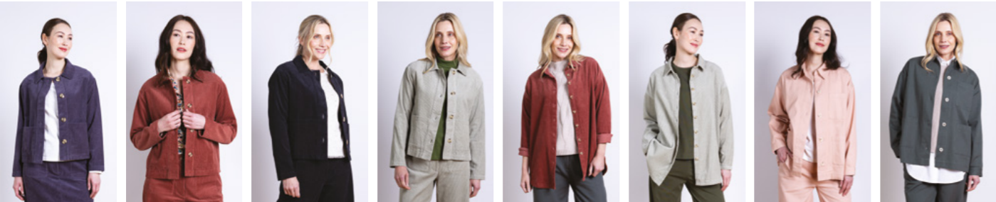
NR6030 / Plum Pg 24 NR6030 / Rose Pg 29 NR6030 / Black Pg 54 NR6030 / Ecrú Pg 40 NR4234 / Rose Pg 28 NR4234 / Ecrú Pg 41 CD6038 / Parfait Pg 31 CD6038 / Buff Pg 33