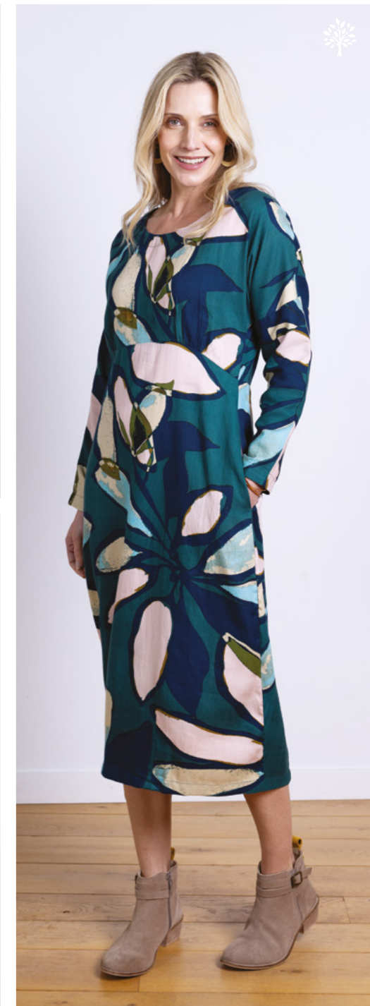
SD2190 / Bubble Midi Dress 100% Textured Tencel Nordic / Sizes 8-20