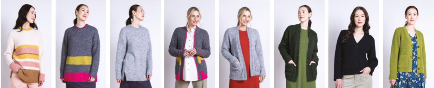
RS7096 / Multi Pg 35 RW7096 / Brights Pg 18 RE7096 / Grey Pg 19 RW7095 / Brights Pg 18 RE7095 / Grey Pg 19 RE7095 / Juniper Pg 40 AP7091 / Black Pg 59 AP7091 / Lime Pg 45