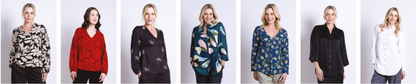
AM4236 / Black Pg 52 AM4236 / Burgundy Pg 51 EM4229 / Black Pg 57 SD4221 / Nordic Pg 42 LC4225 / Oxford Pg 45 VJ4228 / Black Pg 50 PE4248 / White Pg 15,23