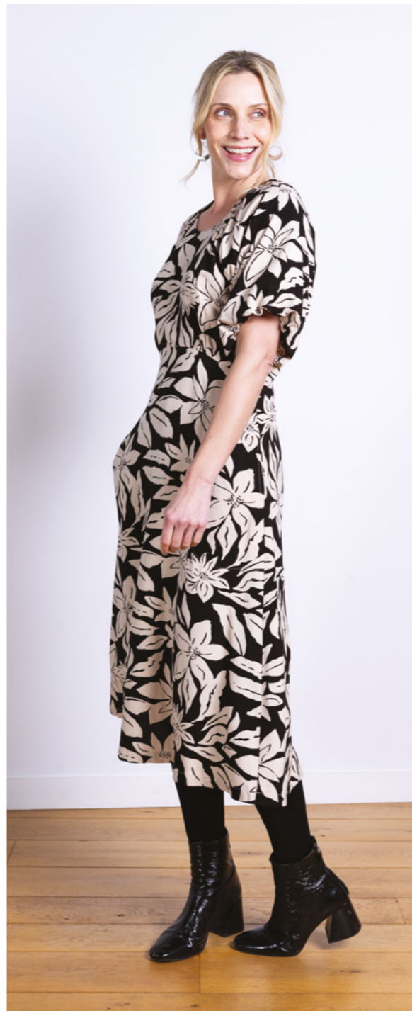
AM2206 / Puff Sleeve Dress 100% Viscose Black / Sizes 8-20