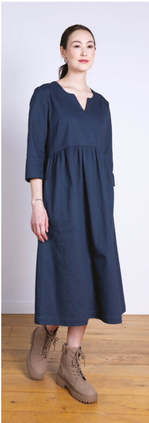
CD2186 / V Neck Midi Dress 100% Cotton Drill Space / Sizes 8-20