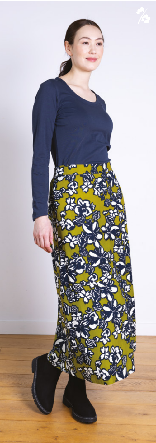
JP4064 / Round Neck Top 100% GOTS Organic Cotton Jersey Oxford / Sizes 8-20