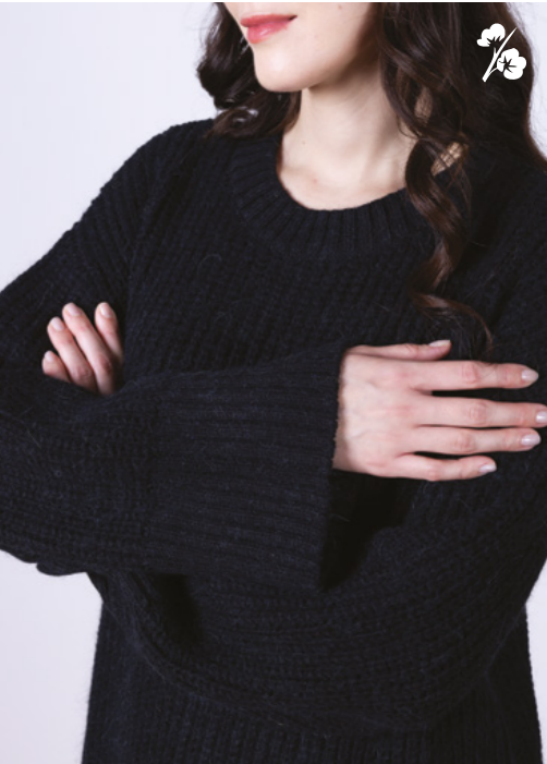
AP7090 / Cosy Round Neck Jumper 83% Organic Cotton, 17% Alpaca Black / Sizes S,M,L