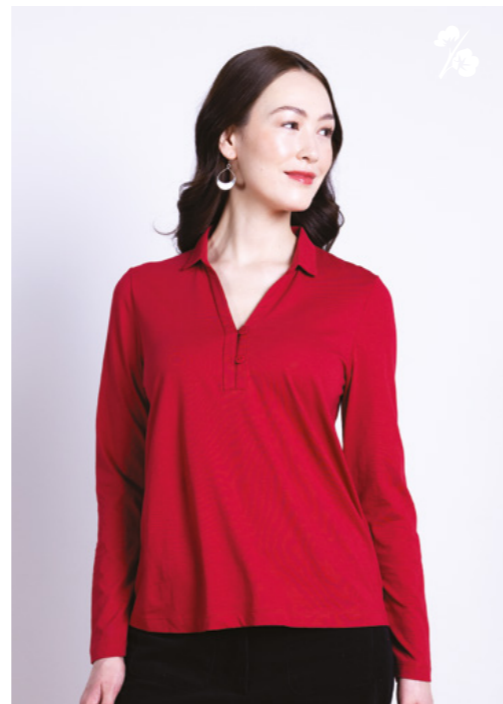
JP4232 / Collared Jersey Top 100% GOTS Organic Cotton Jersey Scarlet / Sizes 8-20