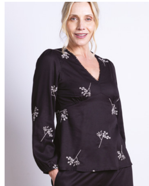
EM4229 / Embroidered Tea Blouse 100% Viscose Twill Black / Sizes 8-20