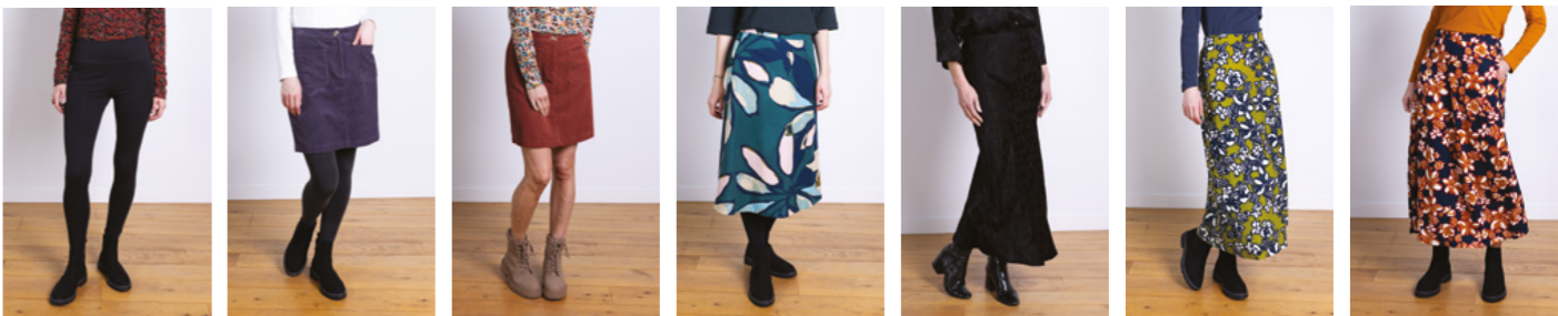
JP1043 / Black Pg 55 NR8051 / Plum Pg 24 NR8051 / Rose Pg 29 SD8061 / Nordic Pg 42 VJ8058 / Black Pg 50 MT8059 / Pea Pg 38 MT8059 / Oxford Pg 10