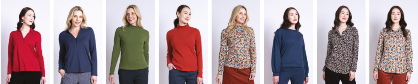
JP4232 / Scarlet Pg 14,56 JP4232 / Oxford Pg 9 RJ4249 / Basil Pg 41 RJ4249 / Rust Pg 19 DL4249 / Ecru Pg 29 MC4223 / Space Pg 13 BP4214 / Alabaster Pg 56 DL4214 / Ecru Pg 28