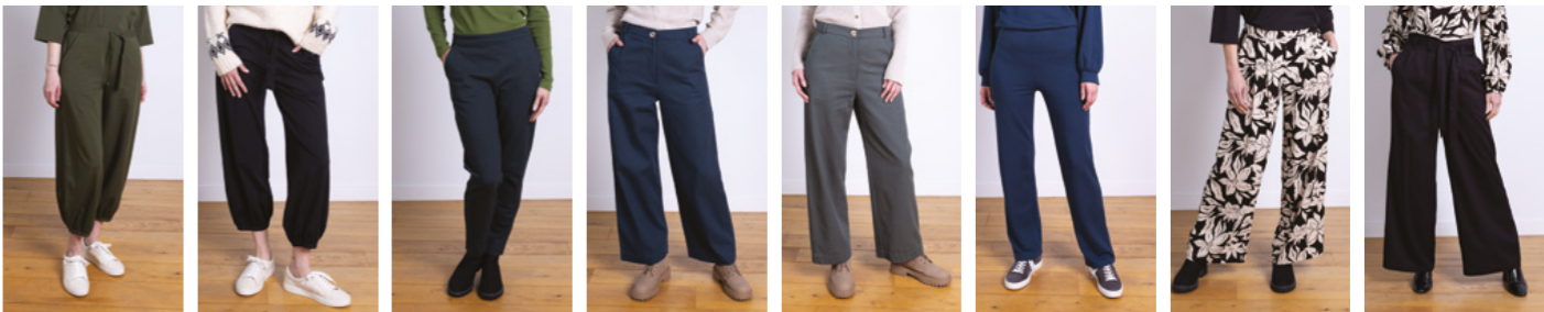
JP1050 / Juniper Pg 40 JP1050 / Black Pg 58 HJ1093 / Midnight Pg 39 CD1088 / Space Pg 21,23,46 CD1088 / Buff Pg 32 MC1091 / Space Pg 13 AM1103 / Black Pg 52 PV1110 / Black Pg 52