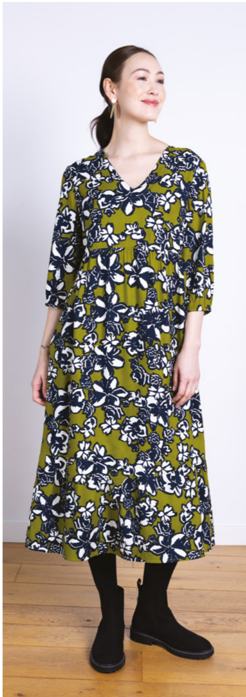
MT2219 / Puff Sleeve Midi Dress 100% Viscose Twill Pea / Sizes 8-20