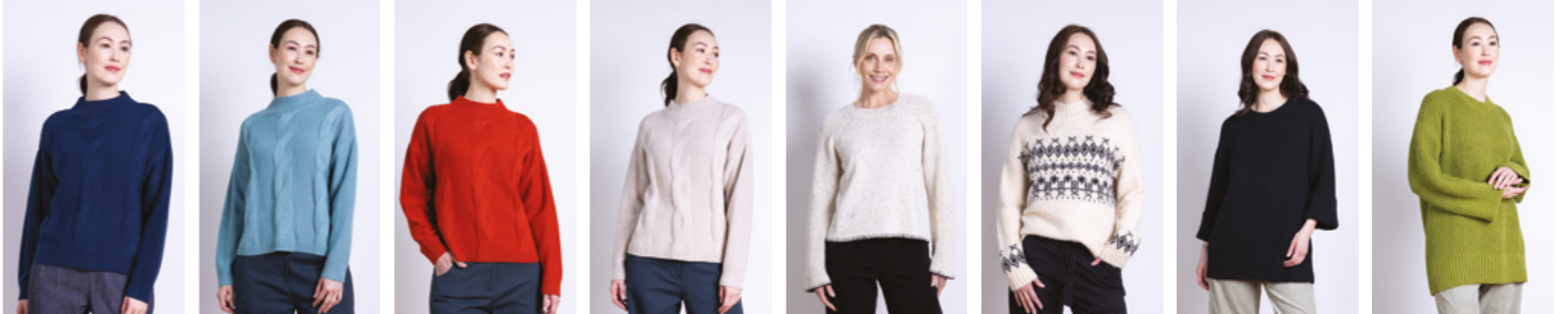
KT7093 / Thunder Pg 14 KT7093 / Arctic Pg 22 KT7093 / Pumpkin Pg 22 KT7093 / Sand Pg 31,46 FC7092 / Ivory Pg 59 RW7089 / Ivory Pg 58 AP7090 / Black Pg 59 AP7090 / Lime Pg 45