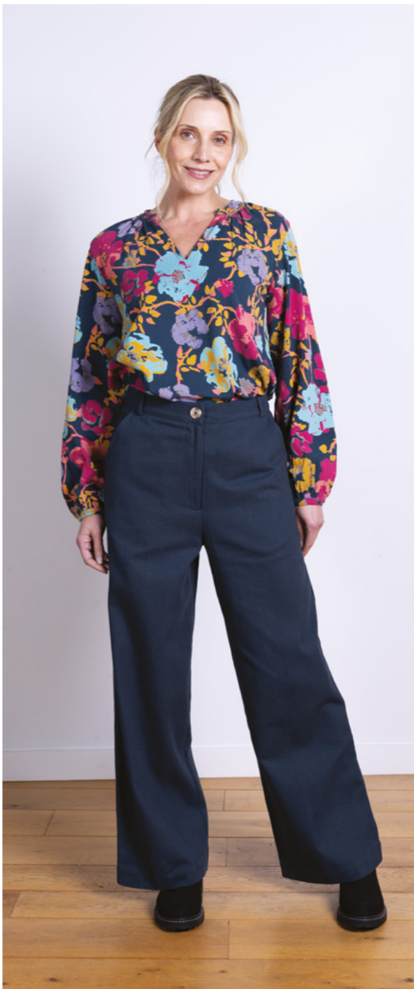
BL4230 / Drapey Top 67% Bamboo, 28% Cotton, 5% Elastane Space / Sizes 8-20