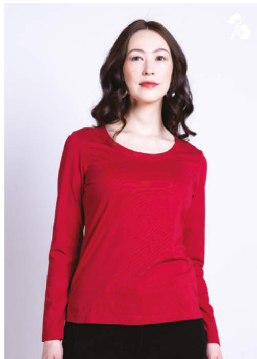
JP4064 / Round Neck Top 100% GOTS Organic Cotton Jersey Scarlet / Sizes 8-20