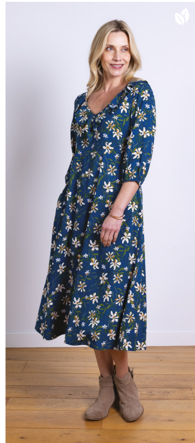
LC2192 / Frill Midi Dress 100% Woven Ecovero Viscose Oxford / Sizes 8-20