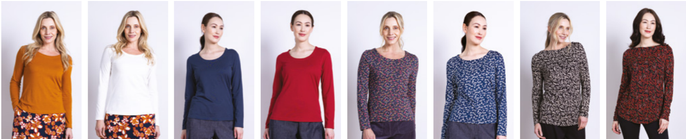
JP4064 / Apricot Pg 10 JP4064 / Ivory Pg 11 JP4064 / Oxford Pg 9,38 JP4064 / Scarlet Pg 15,56 ET4185 / Multi Pg 25 ET4185 / Oxford Pg 9 BP4093 / Alabaster Pg 56 BP4093 / Jam Pg 55