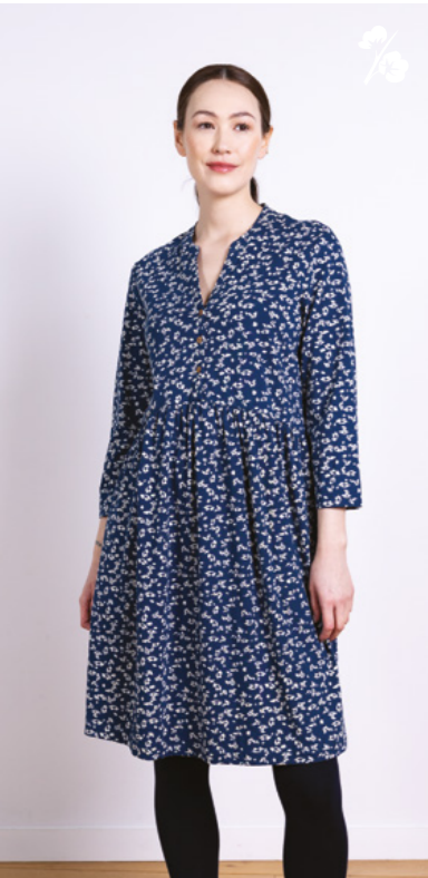
ET3177 / Tunic Dress 100% Organic Cotton Jersey Oxford / Sizes 8-20