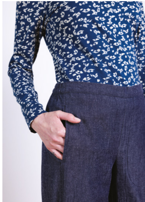
ET0308 / Scarf 100% Viscose Gauze Oxford / One Size