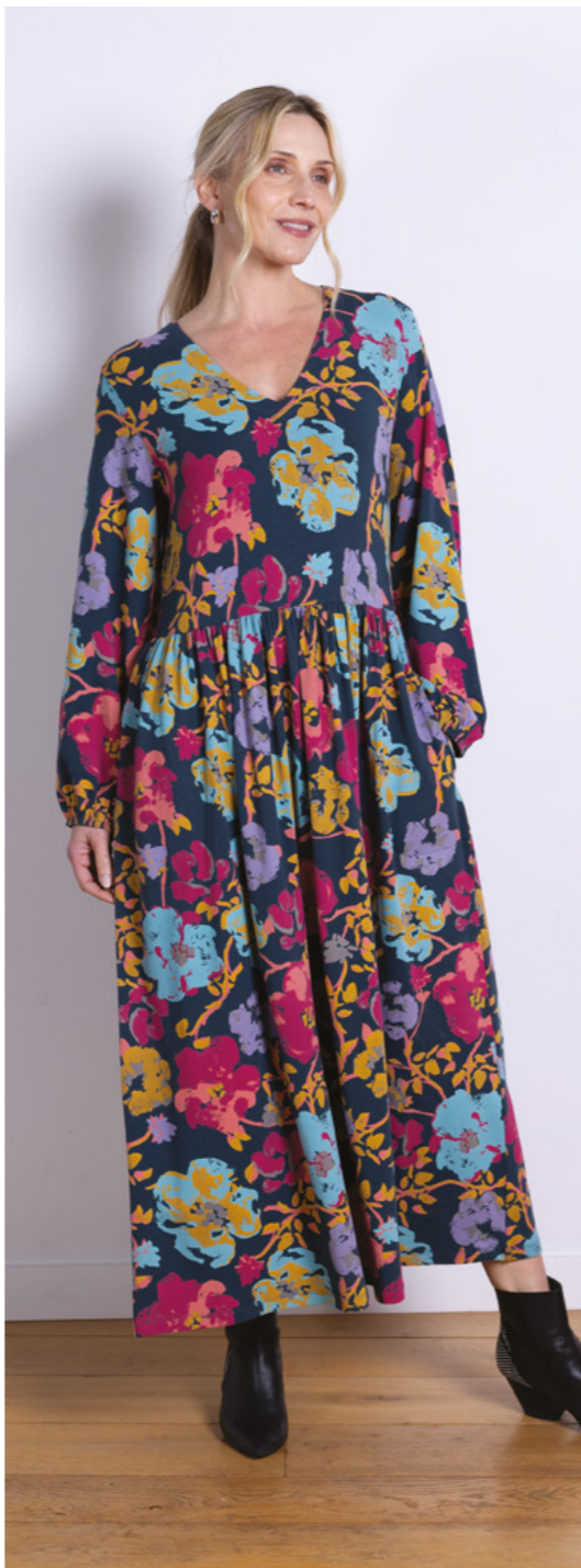
BL2200 / Printed Midi Dress 67% Bamboo, 28% Cotton, 5% Elastane Space / Sizes 8-20