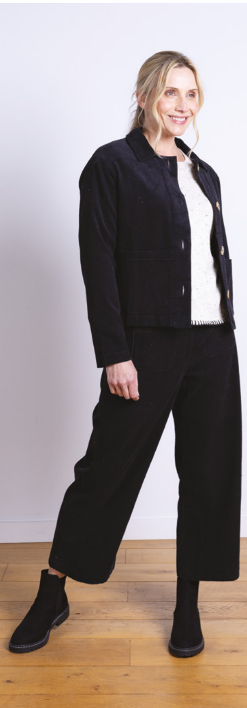
NR6030 / Cord Jacket 100% Cotton Chunky Cord Black / Sizes 8-20