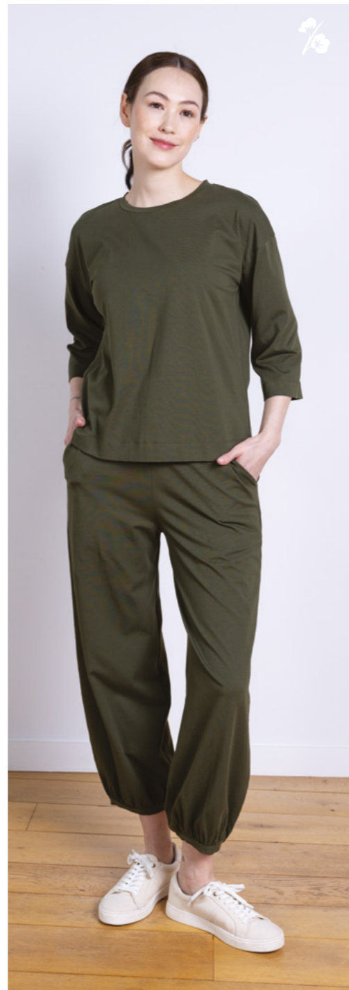
JP4226 / 3/4 Sleeve Jersey Top 95% GOTS Organic Cotton, 5% Elastane Juniper / Sizes 8-20