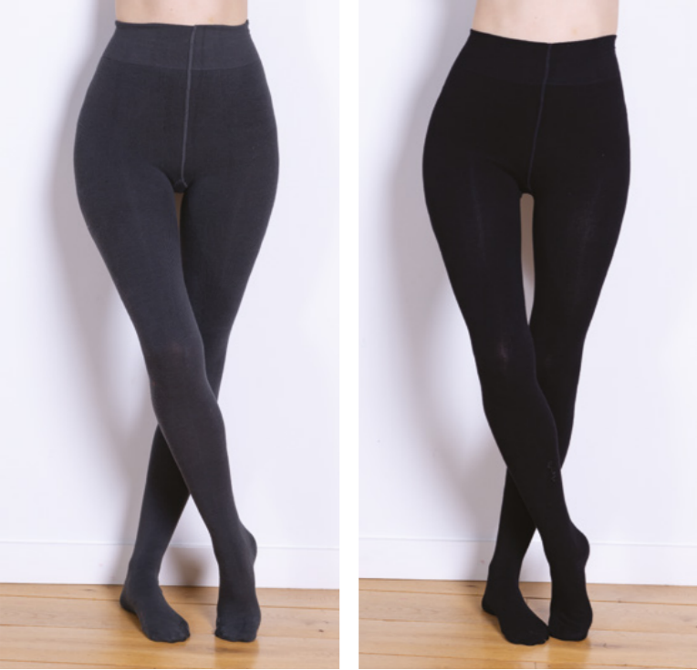
TG0499 / Anthracite TG0499 / Black