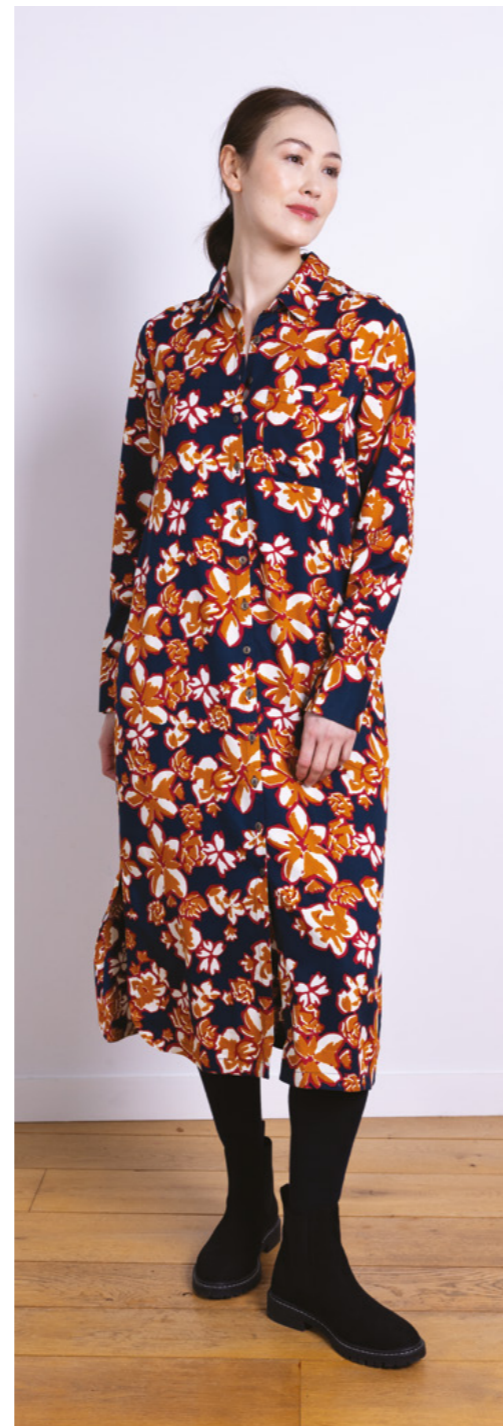
MT2204 / Shirt Dress 100% Viscose Twill Oxford / Sizes 8-20