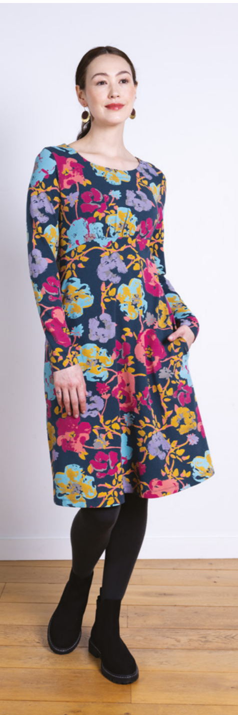
BL3171 / Gathered Front Tunic Dress 67% Bamboo, 28% Cotton, 5% Elastane Space / Sizes 8-20