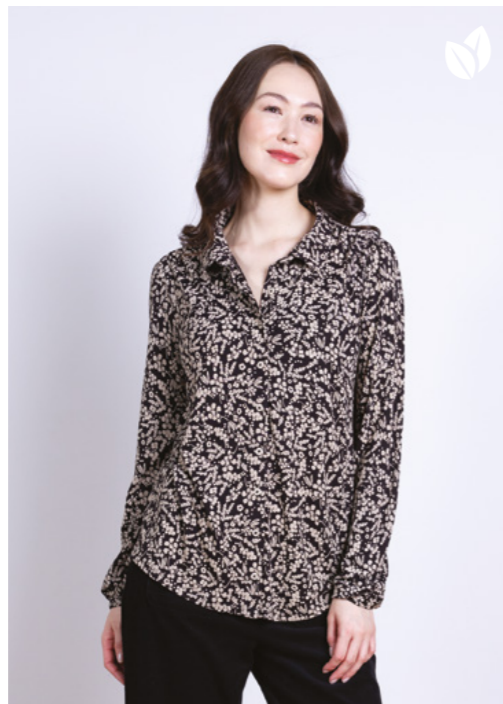
BP4214 / Jersey Shirt 100% Lenzing Ecovero Jersey Alabaster / Sizes 8-20