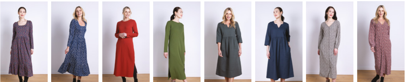
ET2199 / Multi Pg 24 ET2199 / Oxford Pg 9 RJ2194 / Rust Pg 19 RJ2194 / Basil Pg 40 CD2186 / Buff Pg 32 CD2186 / Space Pg 20,47 IV2195 / Buff Pg 32 IV2195 / Scarlet Pg 13