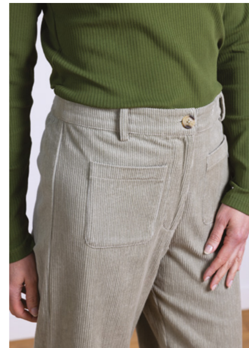
NR4234 / Cord Shirt 100% Cotton Chunky Cord Ecru / Sizes 8-20