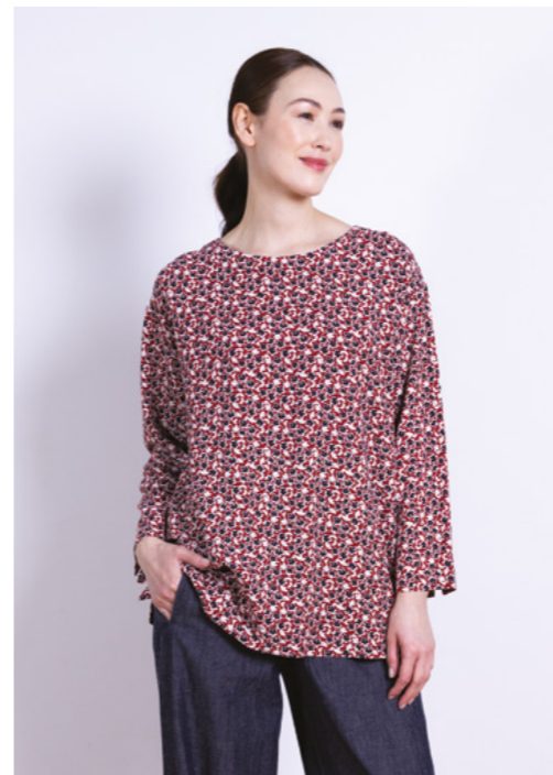
IV0318 / Scarf 100% Viscose Gauze Scarlet / One Size