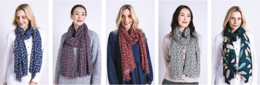
ET0308 / Oxford Pg 8 ET0308 / Multi Pg 25 IV0318 / Scarlet Pg 13 IV0318 / Buff Pg 33 SD0308 / Nordic Pg 43