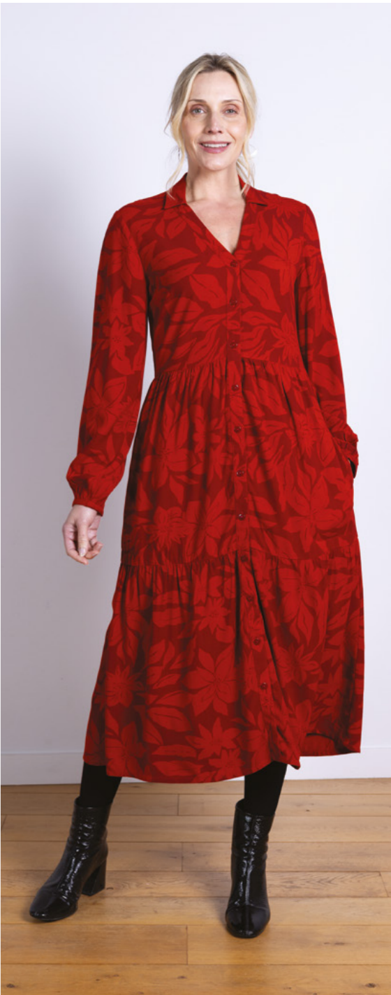
AM2196 / Tiered Midi Shirtdress 100% Viscose Burgundy / Sizes 8-20