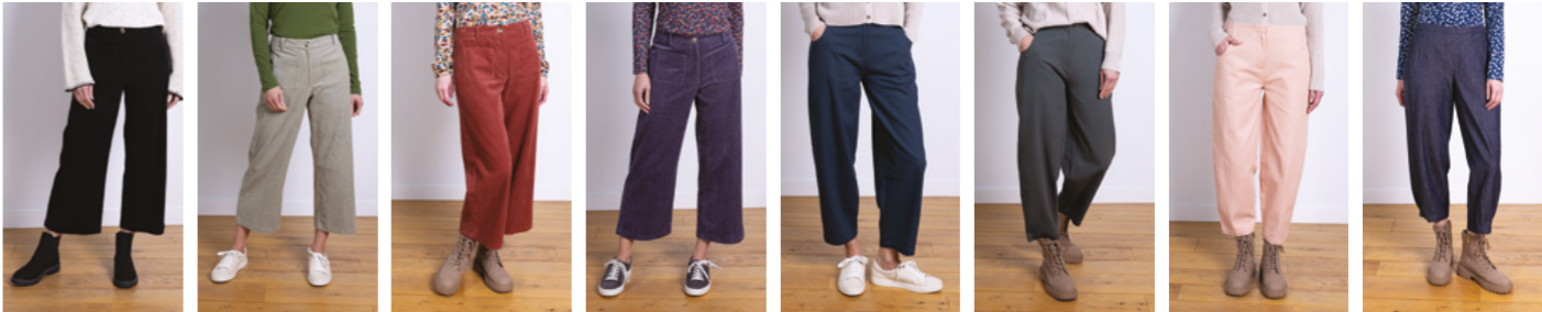
NR1104 / Black Pg 54 NR1104 / Ecru Pg 41 NR1104 / Rose Pg 29 NR1104 / Plum Pg 25 CD1109 / Space Pg 22,46 CD1109 / Buff Pg 32 CD1109 / Parfait Pg 31 CH1087 / Chambray Pg 9