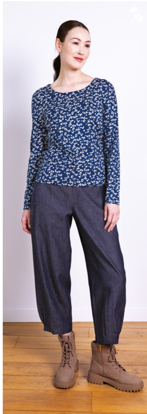
ET4185 / Top 100% Organic Cotton Jersey Oxford / Sizes 8-20