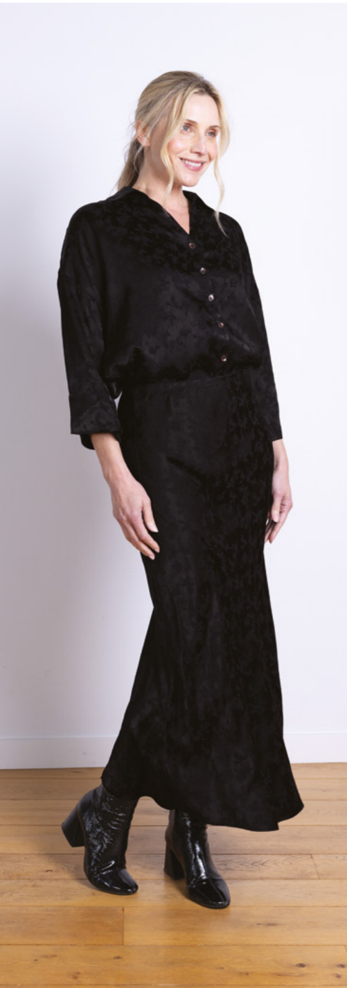
VJ4228 / Jacquard Shirt 100% Viscose Jacquard Black / Sizes 8-20