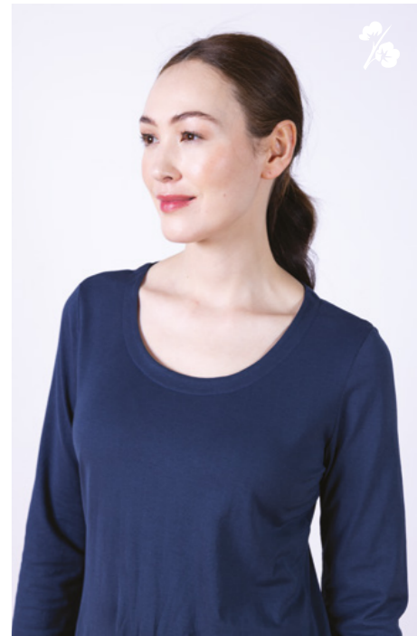
JP4232 / Collared Jersey Top 100% GOTS Organic Cotton Jersey Oxford / Sizes 8-20