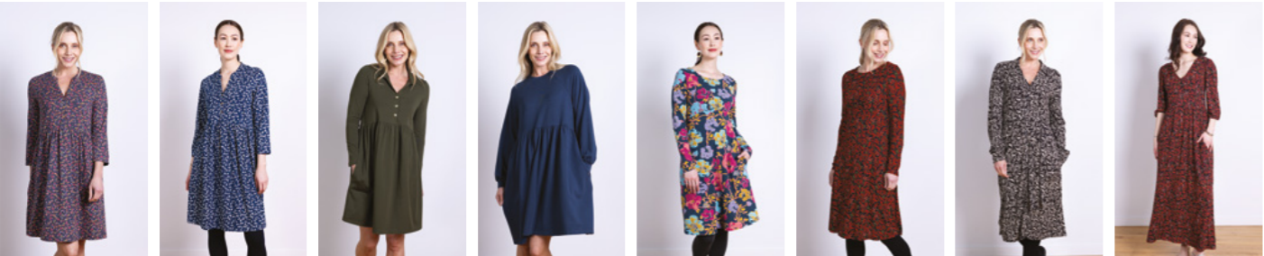
ET3177 / Multi Pg 25 ET3177 / Oxford Pg 8 JP3174 / Juniper Pg 41 MC3170 / Space Pg 12 BL3171 / Space Pg 20 BP3171 / Jam Pg 55 BP2090 / Alabaster Pg 56 BP2193 / Jam Pg 54