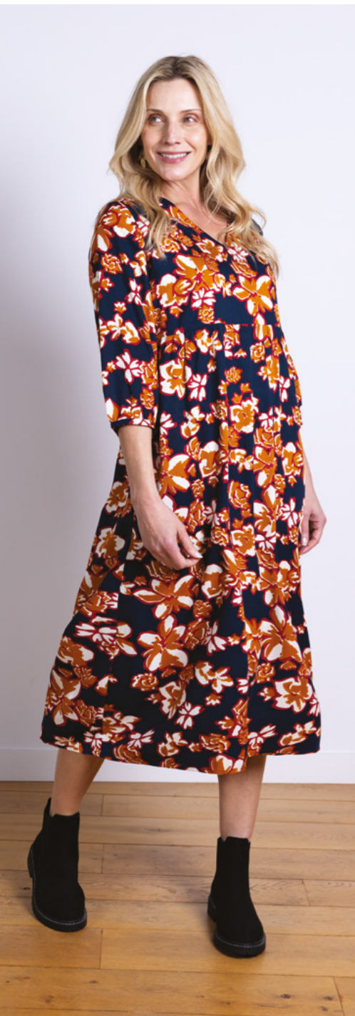
MT2219 / Puff Sleeve Midi Dress 100% Viscose Twill Oxford / Sizes 8-20