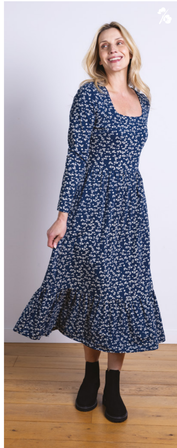
ET2199 / Tiered Dress 100% Organic Cotton Jersey Oxford / Sizes 8-20