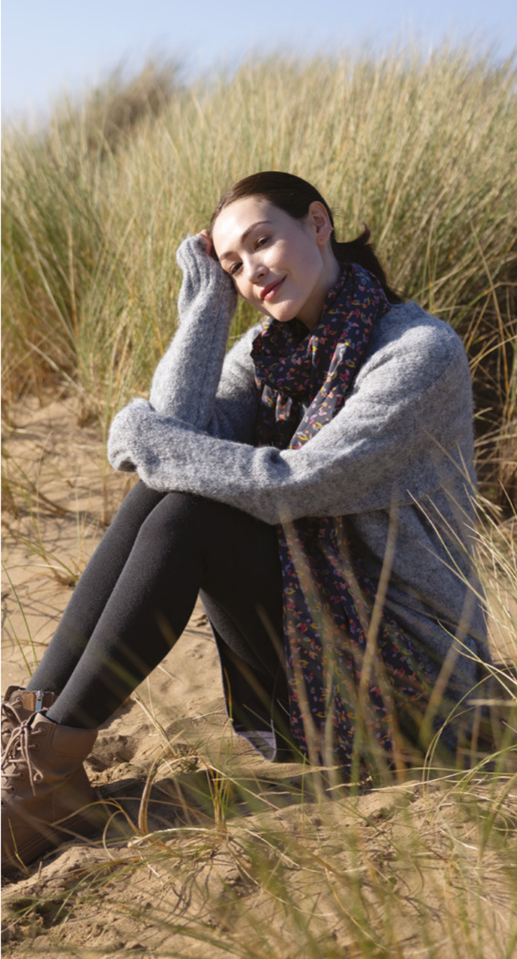
TG0499 / Tights 80% Bamboo, 18% Polyamide, 2% Elastane Anthracite / Sizes S,M,L