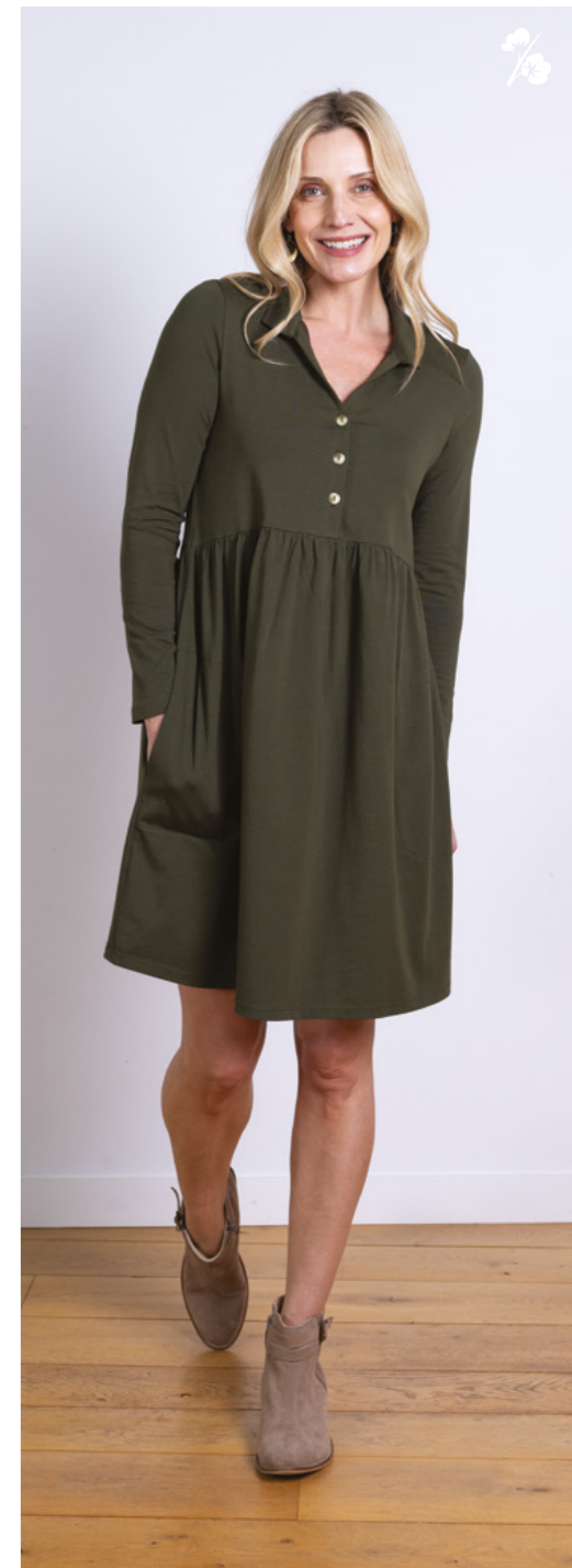
JP3174 / Long Sleeve Tunic Dress 95% GOTS Organic Cotton, 5% Elastane Juniper / Sizes 8-20