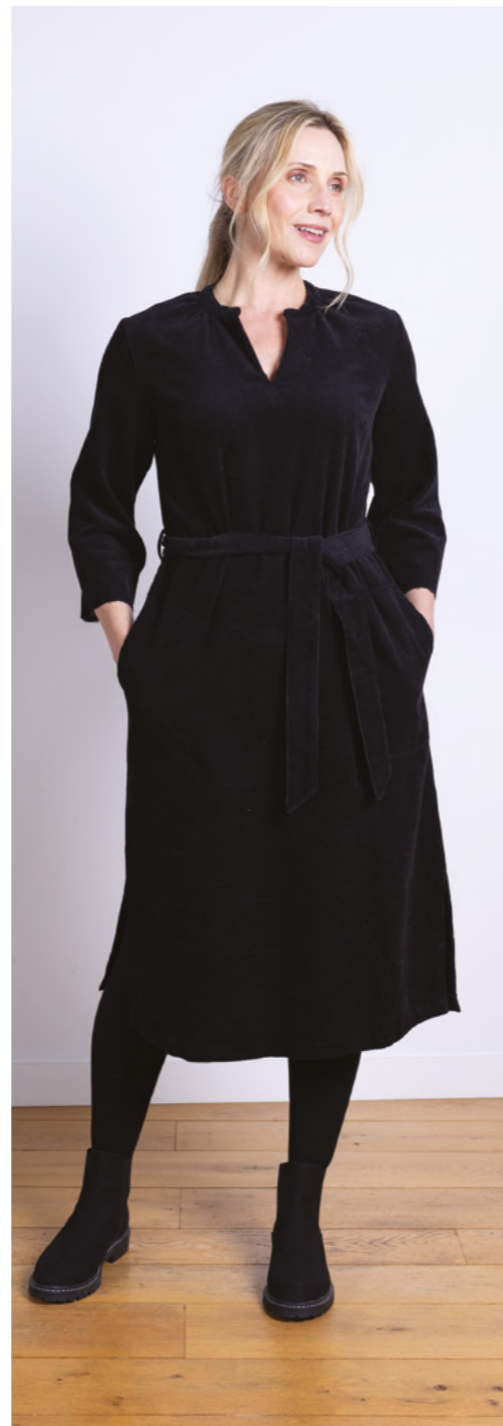
NR2203 / Cord Midi Dress 100% Cotton Chunky Cord Black / Sizes 8-20