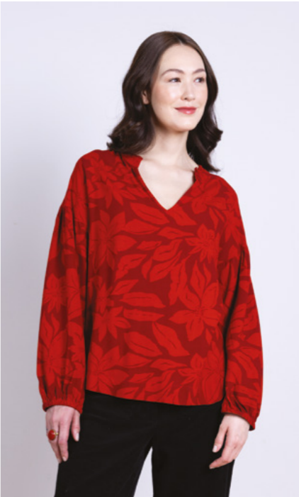
AM4236 / Smock Top 100% Viscose Burgundy / Sizes 8-20