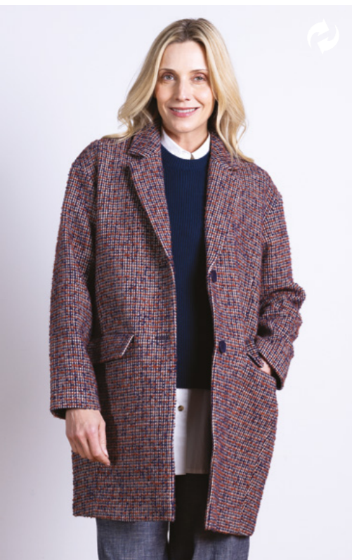
QW6524 / Wool Coat 50% Recycled Polyester, 42% Wool, 5% Alpaca, 3% Others Rust / Sizes 8-20