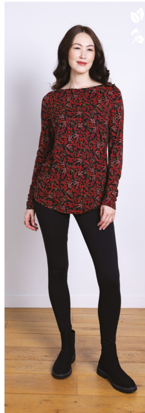
BP4093 / Boat Neck Top 100% Lenzing Ecovero Jersey Jam / Sizes 8-20