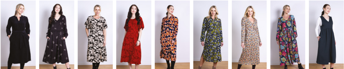
NR2203 / Black Pg 54 EM2205 / Black Pg 57 AM2206 / Black Pg 53 AM2206 / Burgundy Pg 50 MT2204 / Oxford Pg 10 MT2204 / Pea Pg 39 DL2201 / Ecru Pg 28 BL2200 / Space Pg 20 HJ2198 / Midnight Pg 43