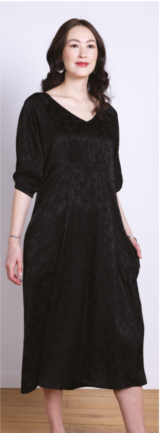
VJ2197 / Jacquard Midi Dress 100% Viscose Jacquard Black / Sizes 8-20