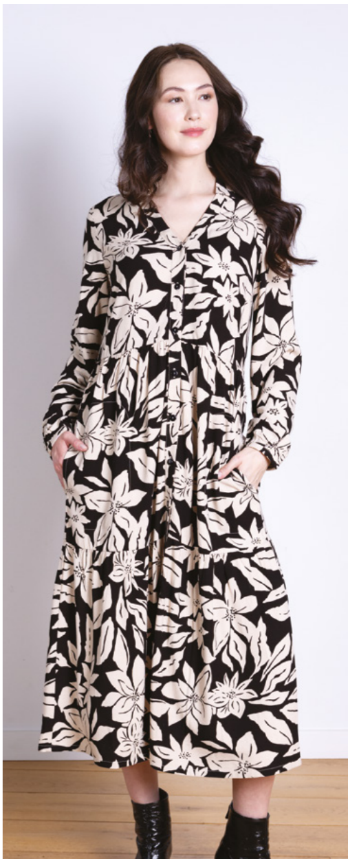
AM2196 / Tiered Midi Shirtdress 100% Viscose Black / Sizes 8-20