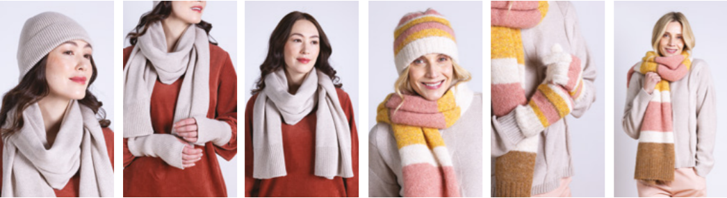
KT0212 / Sand Pg 30 KT0503 / Sand Pg 30 KT0327 / Sand Pg 30 RS0212 / Multi Pg 35 RS0502 / Multi Pg 35 RS0327 / Multi Pg 35