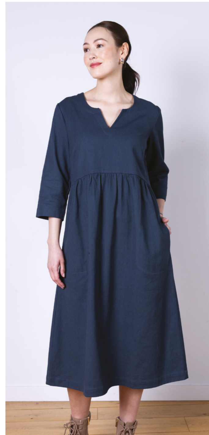
CD2186 / V Neck Midi Dress 100% Cotton Drill Space / Sizes 8-20