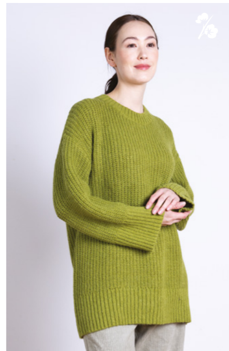
AP7090 / Cosy Round Neck Jumper 83% Organic Cotton, 17% Alpaca Lime / Sizes S,M,L