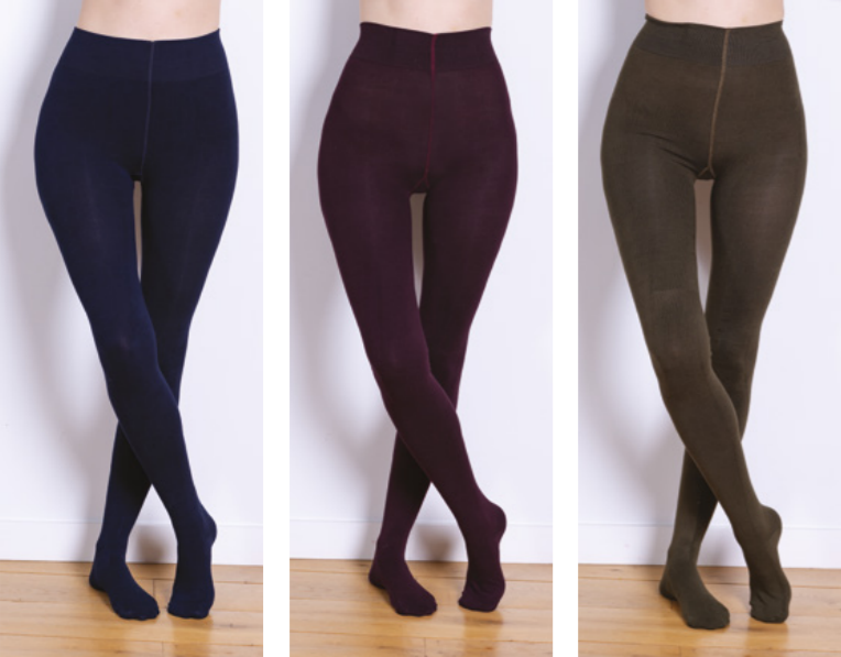
TG0499 / Navy TG0499 / Black Cherry TG0499 / Juniper