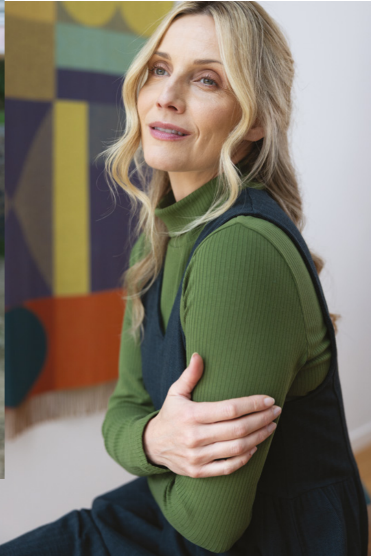
/ NORDIC / JUNIPER / FRENCH NAVY