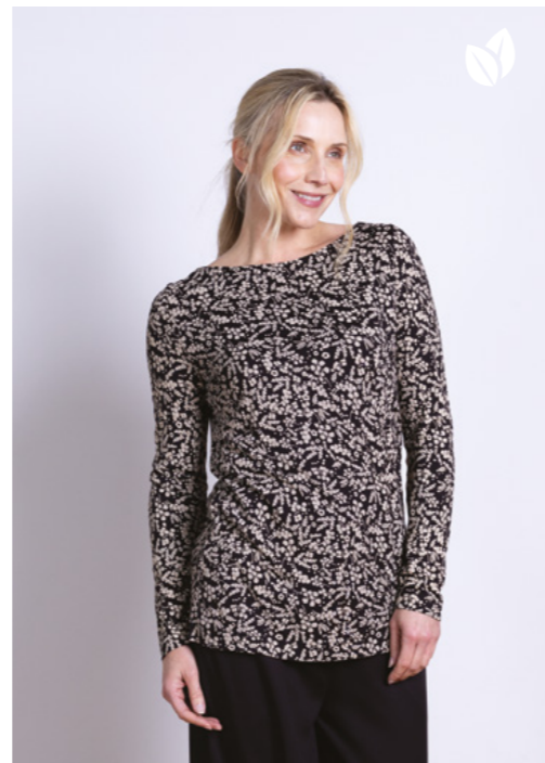
BP4093 / Boat Neck Top 100% Lenzing Ecovero Jersey Alabaster / Sizes 8-20