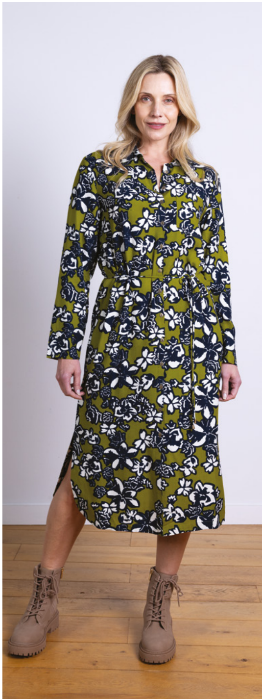
MT2204 / Shirt Dress 100% Viscose Twill Pea / Sizes 8-20