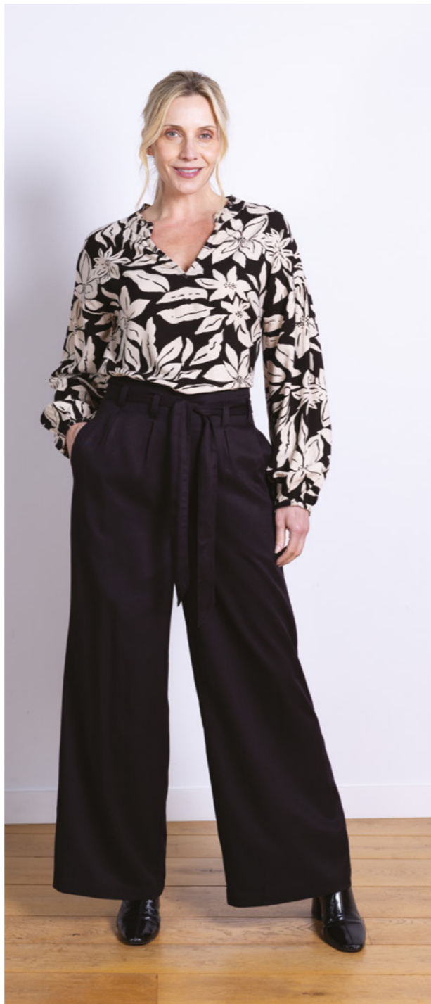
AM4236 / Smock Top 100% Viscose Black / Sizes 8-20