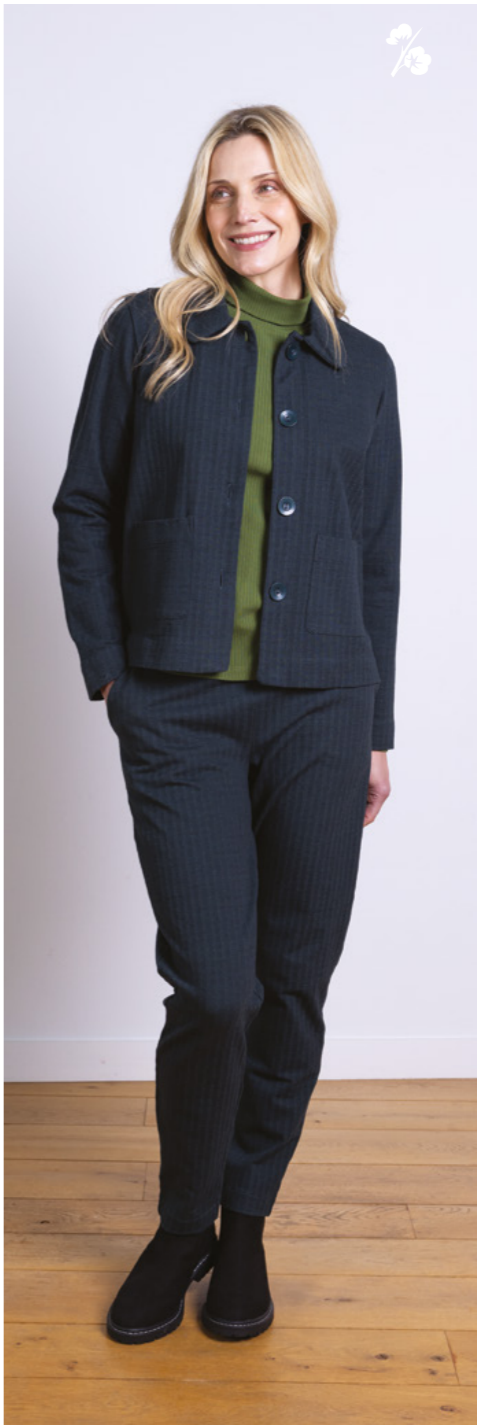
HJ6037 / Jersey Jacket 92% GOTS Organic Cotton Jersey, 8% Elastane Midnight / Sizes 8-20