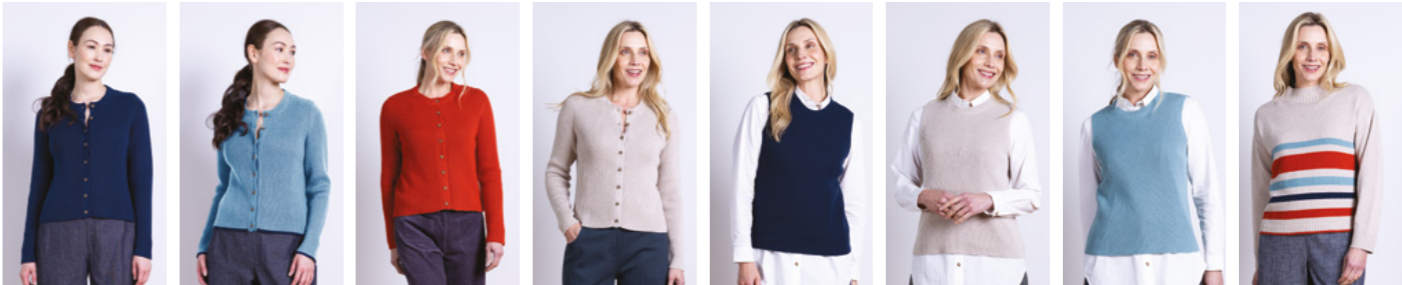
KT7094 / Thunder Pg 11,15 KT7094 / Arctic Pg 21,22 KT7094 / Pumpkin Pg 22 KT7094 / Sand Pg 31,32,46 KT7097 / Thunder Pg 15 KT7097 / Sand Pg 31,47 KT7097 / Arctic Pg 23 KT7098 / Multi Pg 15