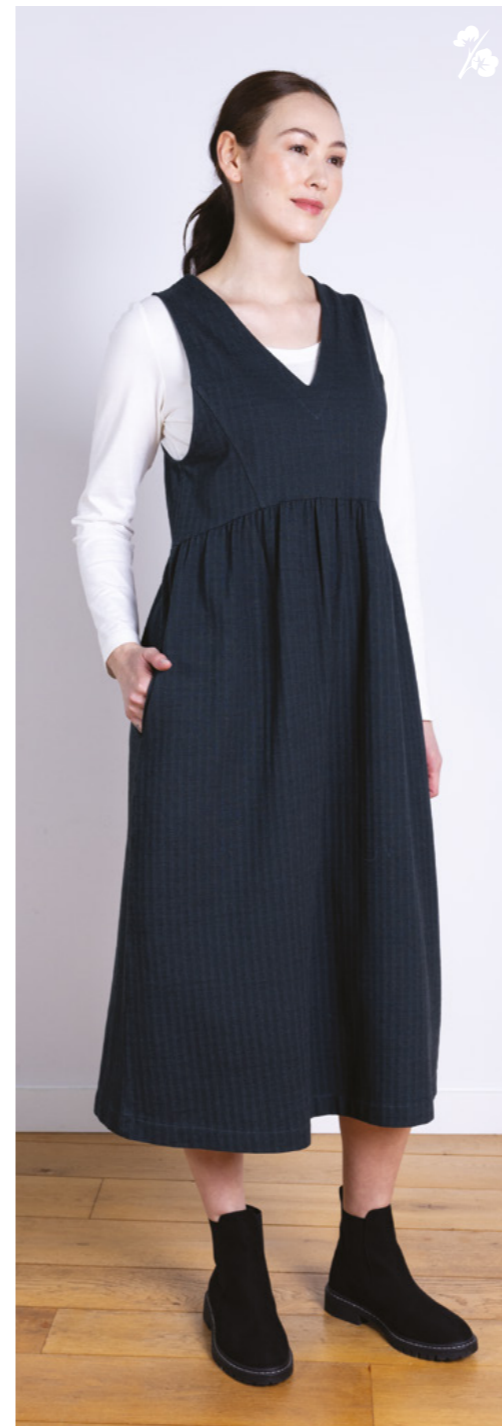
HJ2198 / Jersey Pinafore Dress 92% GOTS Organic Cotton Jersey, 8% Elastane Midnight / Sizes 8-20