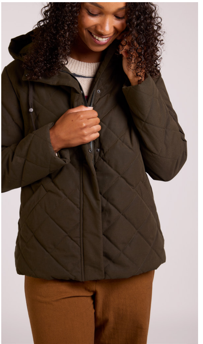
QC6035 / Recycled Fabric Quilted Jacket 65% Recycled Polyester, 35% Organic Cotton (lining 100% Recycled Polyester) Khaki / Sizes 8-20