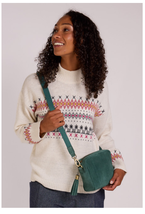
2 COLOURS SIDE POCKET INSIDE POCKET ADJUSTABLE STRAPS TASSLE DETAIL

SB0128 / Suede Crossbody Bag LWG Suede Pine / One Size