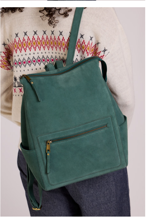
2 COLOURS FRONT POCKET INSIDE POCKET ADJUSTABLE STRAPS SPACIOUS INSIDE

SB0127 / Suede Rucksack LWG Suede Passion / One Size