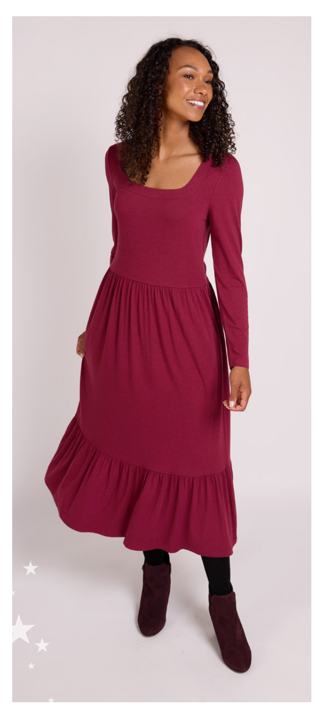
CONTEMPORARY STYLES IN SUPER-SOFT, BREATHABLE BAMBOO JERSEY.