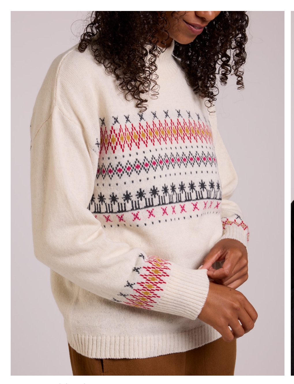
WB7089 / Recycled Fairisle Jumper 35% Recycled Wool, 35% Recycled Manmade Fibres Mix, 30% Bamboo Fairisle / Sizes S-L