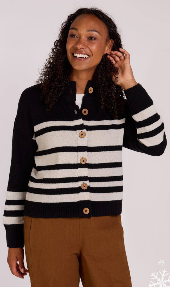
WB7088 / Recycled Chunky Cardi 35% Recycled Wool, 35% Recycled Manmade Fibres Mix, 30% Bamboo Black & White / Sizes S-L