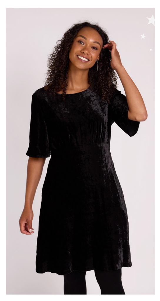
VT3167 / Velvet Tunic Dress 100% Viscose Black / Sizes 8-20