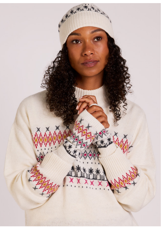
WB0503 / Recycled Knitted Gloves 35% Recycled Wool, 35% Recycled Manmade Fibres Mix, 30% Bamboo Fairisle / One Size

OUR NEW RANGE OF WINTER KNITWEAR, PERFECT FOR THE COOL DAYS AHEAD