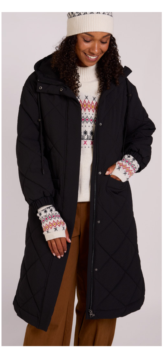
QP6522 / Recycled Quilted Coat 100% Recycled Polyester Black / Sizes 8-20