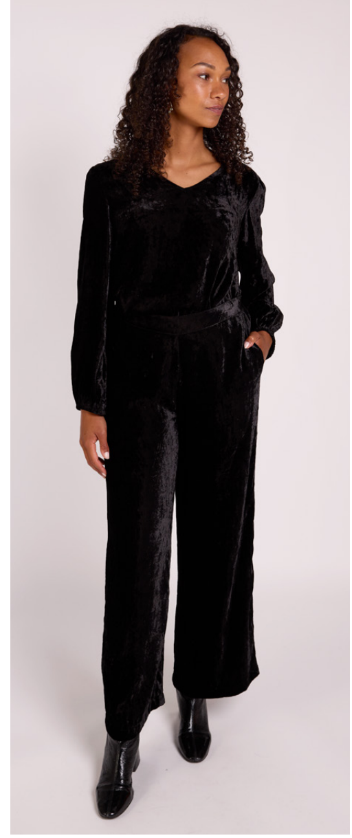
VT4215 / Velvet V Neck Top 100% Viscose Black / Sizes 8-20

VT1101 / Velvet Wide Leg Trouser 100% Viscose Black / Sizes 8-20