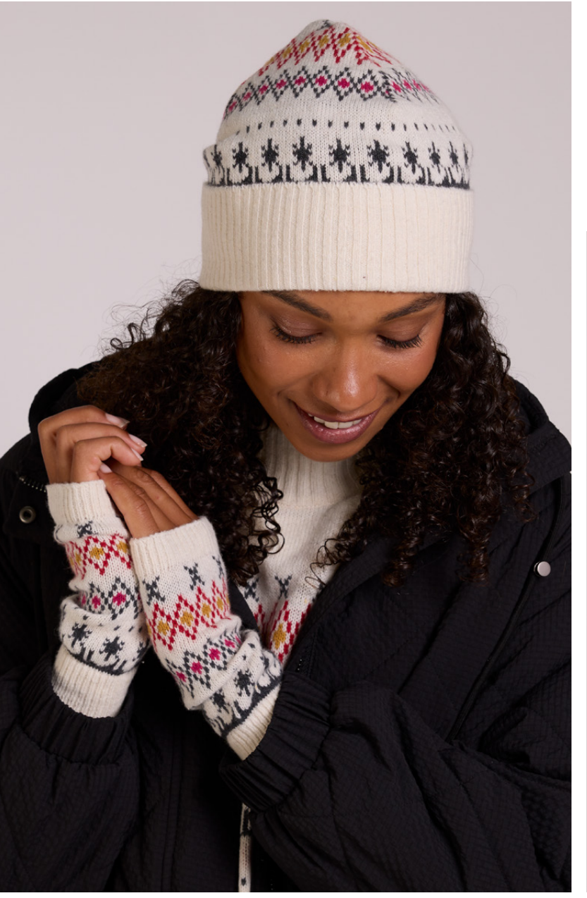
WB0212 / Recycled Knitted Hat 35% Recycled Wool, 35% Recycled Manmade Fibres Mix, 30% Bamboo Fairisle / One Size

OUR NEW RANGE OF WINTER KNITWEAR, PERFECT FOR THE COOL DAYS AHEAD