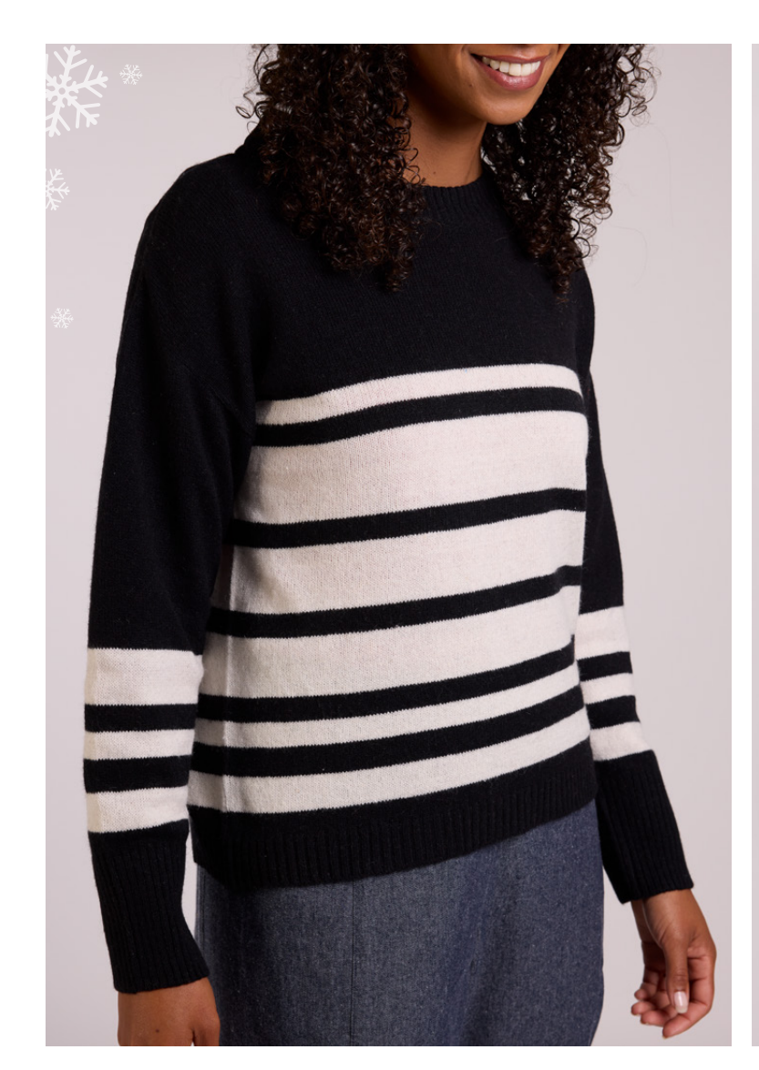
WB7087 / Recycled Striped Chunky Jumper 35% Recycled Wool, 35% Recycled Manmade Fibres Mix, 30% Bamboo Black & White / Sizes S-L